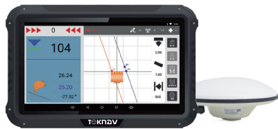
Intelligent Display Screen